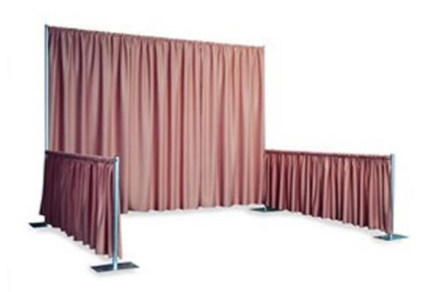
(10' x 8' example image)